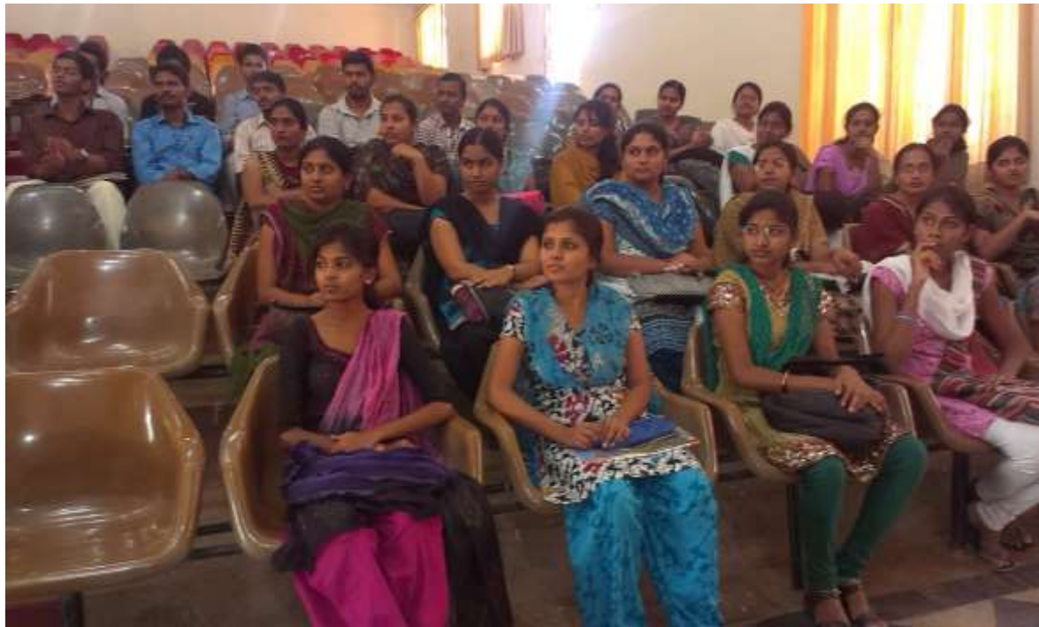
Students present during address