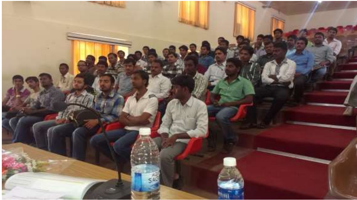
Students present during address