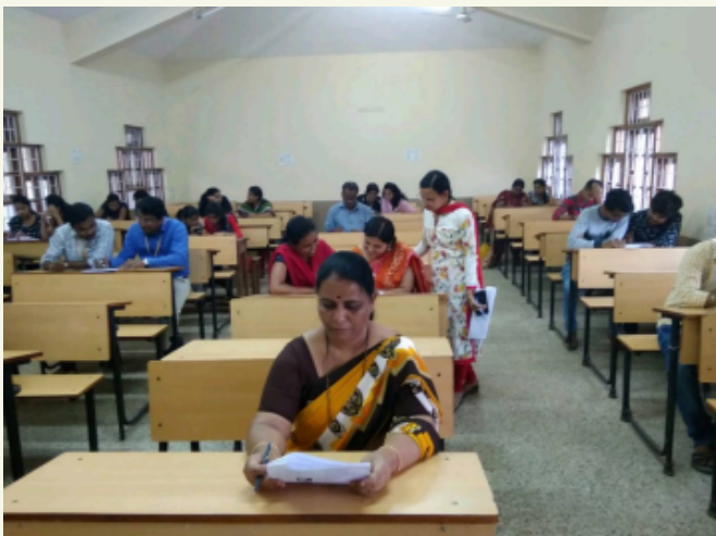
A quiz competition was held department where lecturers and students took active participation.