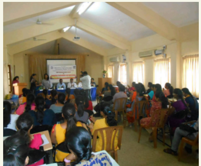
A guest lecturing on computer technologies and applications was held by CSE department, Where new Technologies and applications were being introduced to students