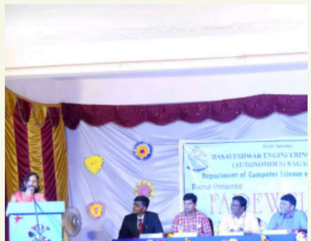
BE computer students were given farewell by computer science and engineering department