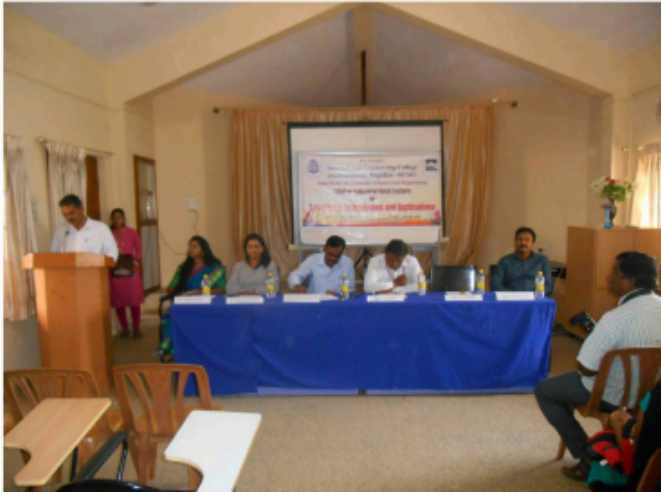
A Guest lecturing on computer Technologies and applications