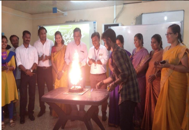
Celebrating Teachers Day