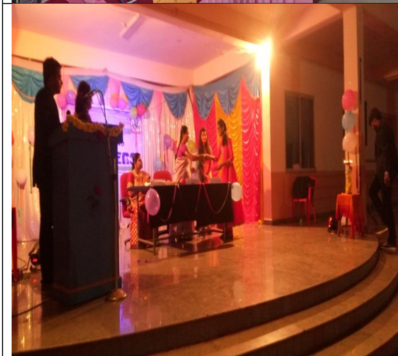
Freshers Day to make the young ones to feel welcome and to interact with them as a formal introduction